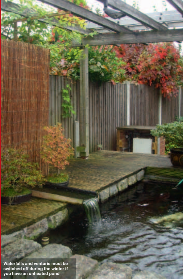
Waterfalls and venturis must be switched off during the winter if you have an unheated pond