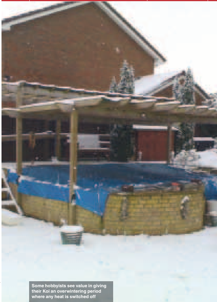
Some hobbyists see value in giving their Koi an overwintering period where any heat is switched off