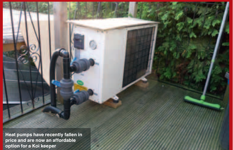
Heat pumps have recently fallen in price and are now an affordable option for a Koi keeper

this category, heating is a more natural approach.