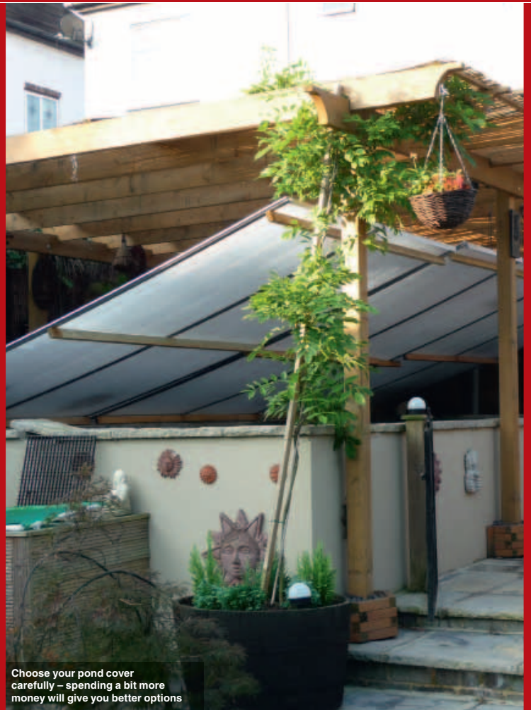
Choose your pond cover carefully – spending a bit more money will give you better options

► using this style of heater. This is due to the fact that units of 3kW and below can be plugged into a three-pin plug, while units of 4kW and above have to be wired directly to the consumer unit and so require installation via a qualified electrician. It must be said, though, that if you're in doubt about anything, you should always consult a qualified electrician first. As a rule of thumb, you must allow 1kW of electricity for every 1,000 gallons of pond water.