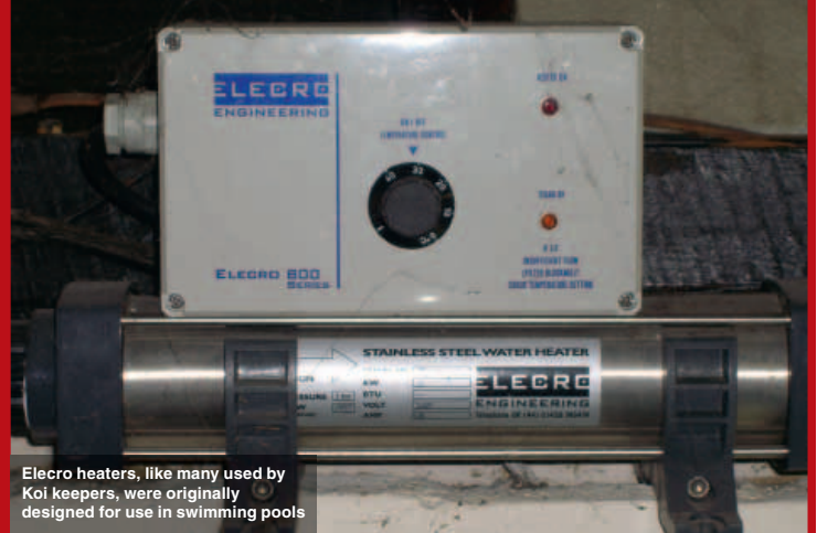
Elegro heaters, like many used by Koi keepers, were originally designed for use in swimming pools