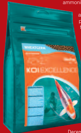
Feed your Koi a low-protein food, at reduced levels, for a short period every year – whether you heat the pond or not

You could also use polycarbonate to construct a more substantial pond cover. It is available in numerous 'wall' thicknesses (the more 'walls' you have the better the installation) but, as a general rule of thumb, ▶